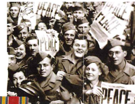
Victory in Europe Day, May 8, 1945