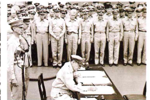
Aboard USS Missouri , Gen. Douglas A. MacArthur, Commander of the Allied Powers in the Pacific, signs documents ending the war on September 2, 1945.

All those who served received the WWII Victory Medal (above) that also adorns the pavilion floors.